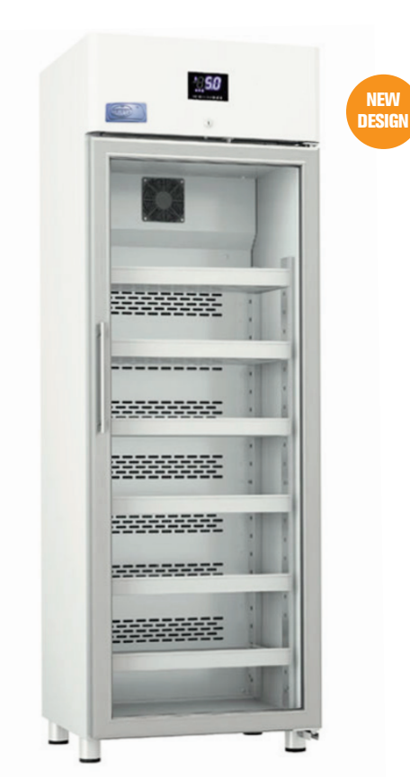
Model Pharmalow M with 6 shelves.