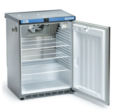
Model Medilow S. Capacity: DBO 2 blocks